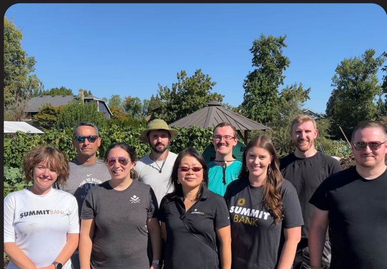
Our Eugene & Springfield team at our annual United Way Volunteer Day.