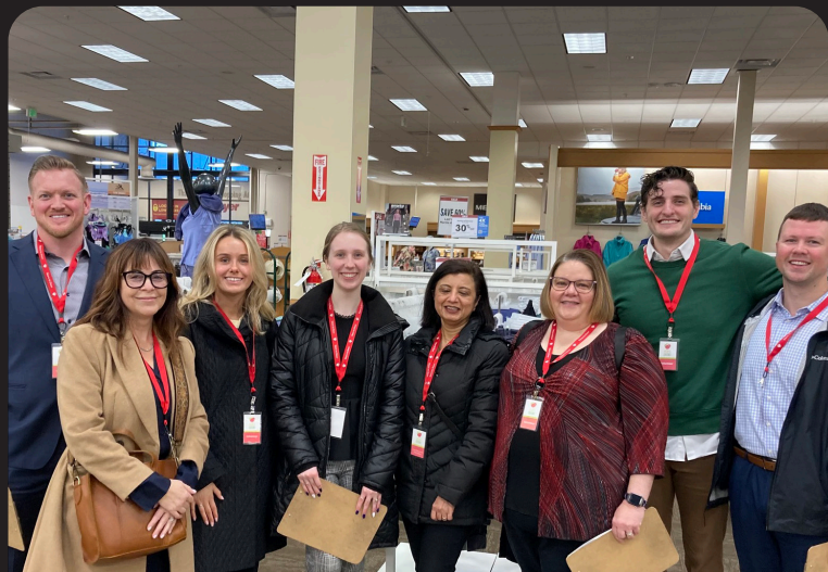
Our Downtown PDX & Westside office volunteer shopping for Store to Door.