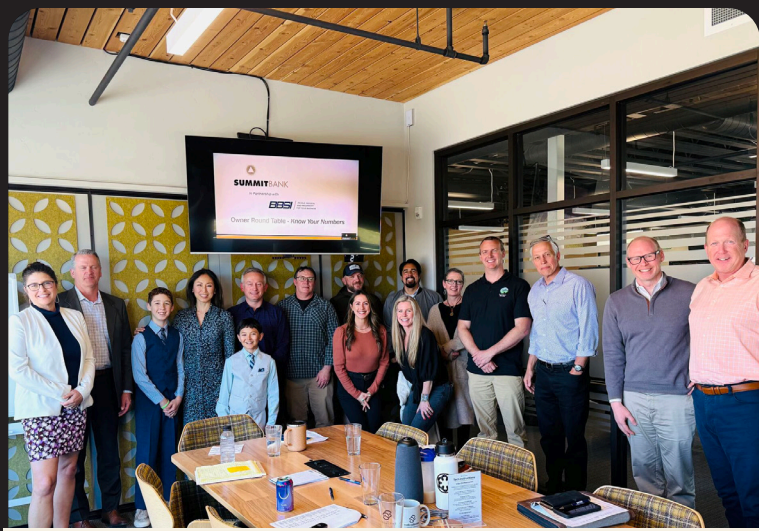
Central Oregon colleagues teaching financial literacy to business owners through BBSI.